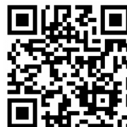
Buy Me a Coffee