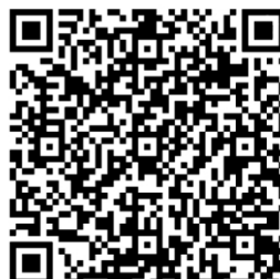
Work in the ends while knitting