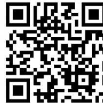
Buy Me a Coffee